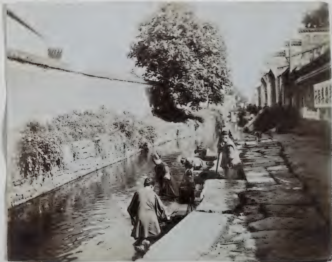
A Canal scene, Ningbo.